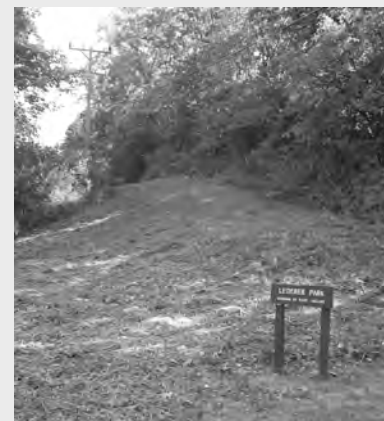
Eagle Scout site project ready for planting

The third park project that received grant funding was an Eagle Scout project to relandscape the bank at the intersection of University Drive and Walnut Spring Lane (part of Lederer Park). Unfortunately, this visible location also supports overhead electrical conductors and an underground high pressure gas line. Because of these utilities, trees in the area have been removed and shrubs and tall growing weeds have created quite an eyesore in a very prominent location. Columbia Gas approached the Borough and suggested that this area be replanted with small native trees, shrubs and other plants that do not interfere with utilities. Upon their suggestion, we applied for an Environmental Challenge Grant that their parent Company, NISource, offered and we were awarded a grant. The local Columbia Gas office doubled the amount in order to complete the entire project with Grant funds. An Eagle Scout candidate took the project on as the requirement for his badge and developed a planting plan, ordered the plant material and will install the plantings this fall. The grant funds will allow us to turn this highly visible location into an area of beauty and an inviting entrance into Lederer Park.