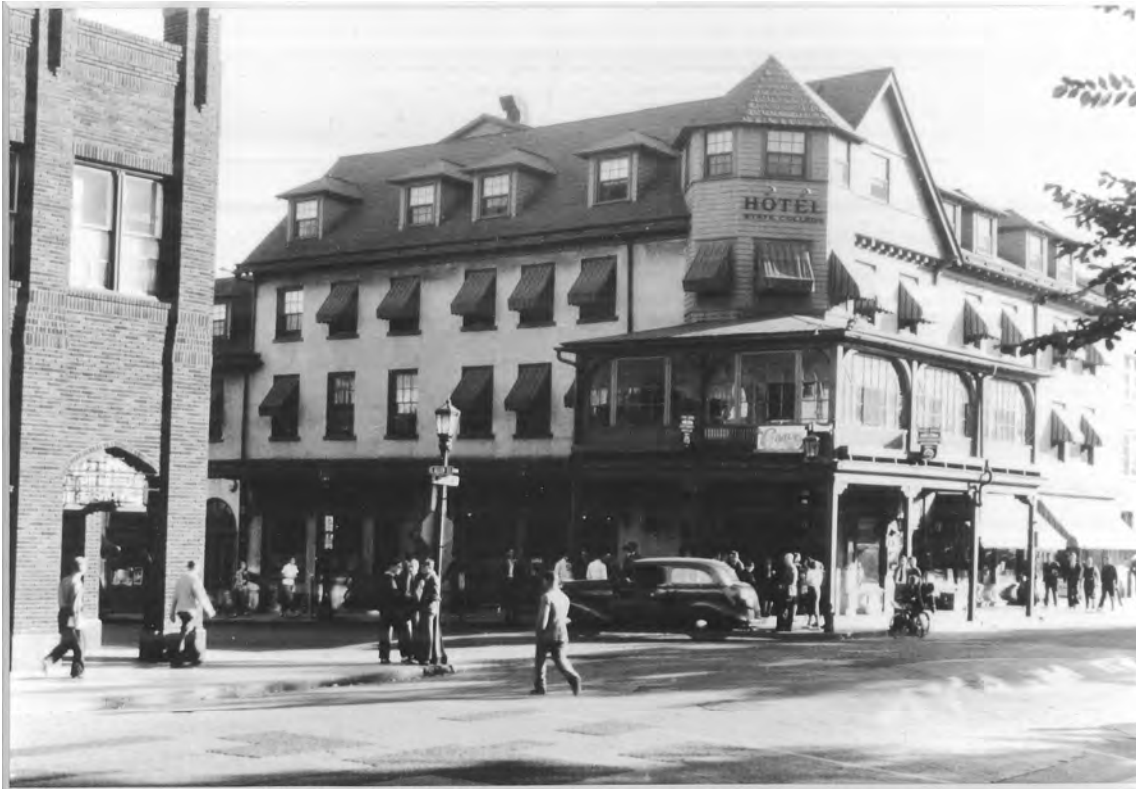
Hotel State College, Co-Op Corner in 1939.