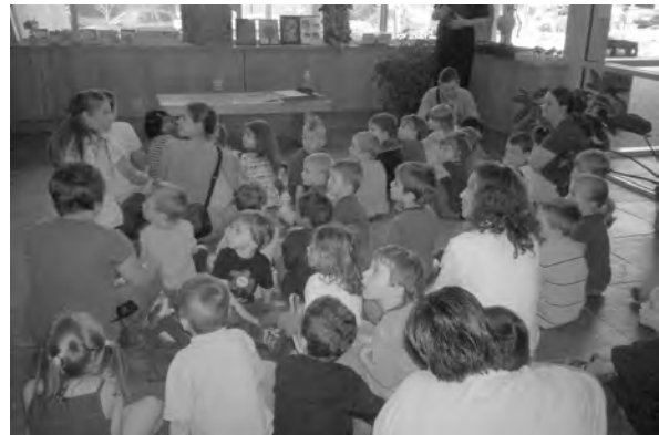
Top right: Children gather for story time at the Municipal building as part of the National Week of the Young Child.